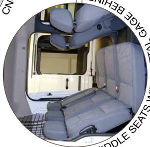
MIDDLE SEATS WITH METAL GAGE BEHIND