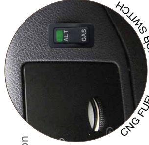
CNG FUEL SELECTOR SWITCH