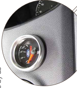
CNG FUEL GAUGE