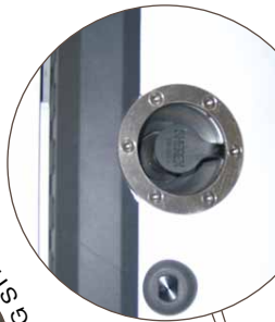
CNG FUEL RECEPTACLE