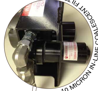
10 MICRON IN-LINE COALESCENT FILTER