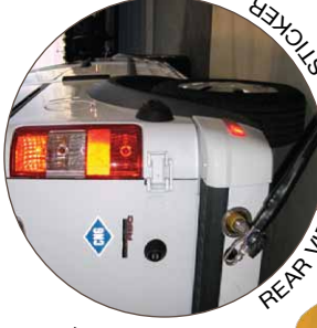
REAR VIEW WITH CNG STICKER