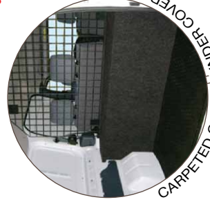
CARPETED CNG CYLINDER COVER